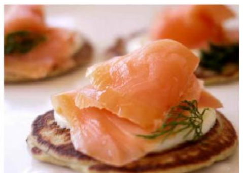
Minimum $25.00 per person